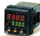
High - end Digital Temperature Indicator