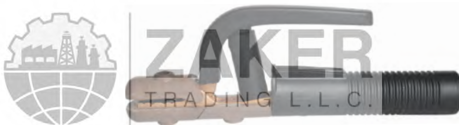
MODEL - TTA-500