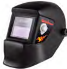
AUTOMATIC WELDING HELMET MODEL- 401