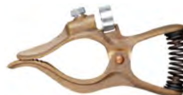
MODEL - WFA300/WFA500