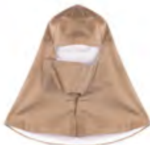
WELDER DUST CAP JEANS / COTTON