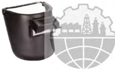
WELDING HELMET - SPRING TYPE MODEL- KH101