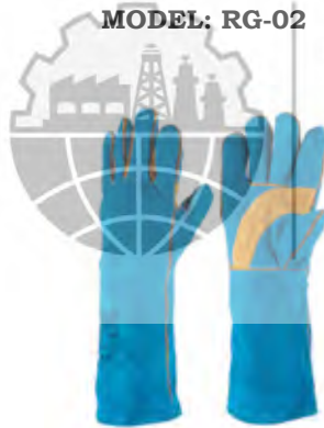
ARC WELDING GLOVES MODEL: RG-02

STANDARD- EN-388 EN-407 EN-12477 CAT- II EN420 SIZE: 16"