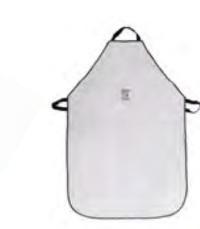
LEATHER APRON MODEL - LA-1

STANDARD- EN-11611 EN-407 EN-420 EN-388 CE- CAT-1 SIZE: 24 X 36