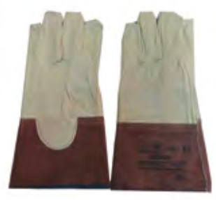
TIG WELDING GLOVES MODEL: TIGMAN 4000

STANDARD- EN-388 EN-407 EN-12477 CAT- II EN420 SIZE: 12"