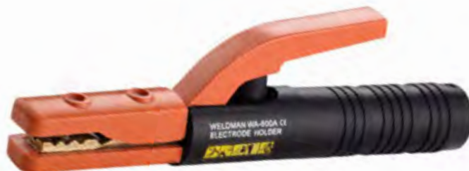
MODEL - WA-600