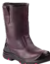
WELDER BOOT - MODEL - 8061

STANDARD - EN ISO 345 S3 CI, SRC,HRO,WRU SIZE- 39 TO 46