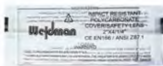
POLYCARBONATE COVER SAFETY LENS

CE EN166 / ANSI Z87.1 SIZE - 2" X 4 - 1/4"