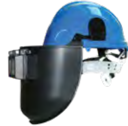
WELDING HELMET WITH SAFETY HELMET MODEL- FSHL-R1701B