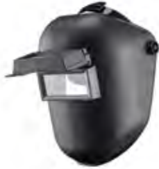
WELDING HELMET WITH LENS MODEL- WH-001