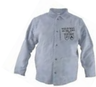
LEATHER JACKET MODEL - LJ-1

STANDARD- EN-11611 EN-407 EN-420 EN-388 CE- CAT-1 SIZE: FREE, L, XL