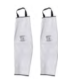
LEATHER HAND SLEEVE MODEL - LHS

STANDARD- EN-11611 EN-407 EN-420 EN-388 CE- CAT-1