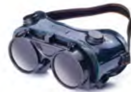
WELDING GOGGLE MODEL- 001