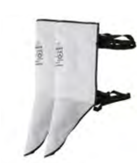
LEATHER LEG GUARD MODEL - LLG

STANDARD- EN-11611 EN-407 EN-420 EN-388 CE- CAT-1