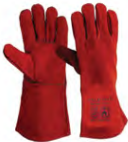
ARC WELDING GLOVES MODEL : RG-01

STANDARD- EN-388 EN-407 EN-12477 CAT- II EN420 SIZE: 16"