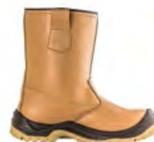
WELDER BOOT - MODEL - 329T

STANDARD - EN ISO 345 S3 CI SRC WRU SIZE- 39 TO 46