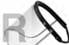
FACE SHIELD VISOR WITH BRACKET MODEL- FC45