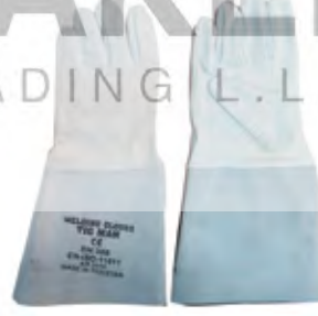
TIG WELDING GLOVES MODEL :TIGMAN

STANDARD- EN-388 EN-407 EN-12477 CAT- II EN420 SIZE: 14"